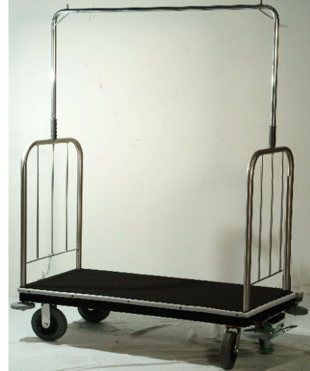
Luggage & Garment Trolley Supplied with a Hanging Rail for Coats & Dresses

1800mm Luggage & Garment Trolley 1200mm Luggage & Garment Trolley