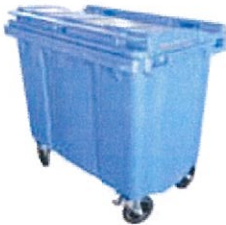
W9207 660 litre Waste Bin