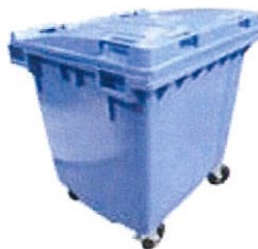
W9208 1100 litre Waste Bin