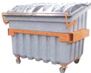
E1817 3000 litre Mega Bin