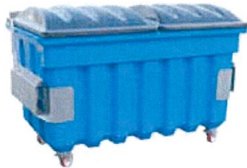
E1807 1500 litre Dump Master