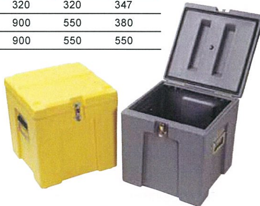
E1215A Small Utility Tool Box