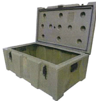
E0936A Medium Utility Tool Box