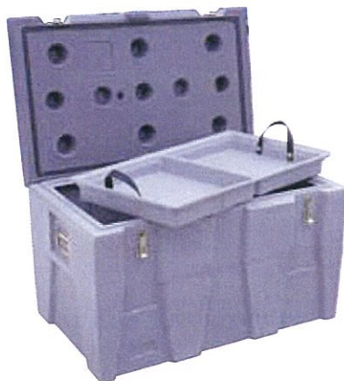
E1140 Large Utility Tool Box