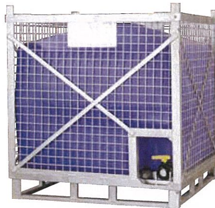
E0445 1000 litre Bulkibox™