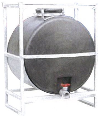
E0076 450 litre Liquid Transporting Tank