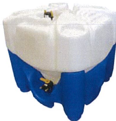
E1664 500 litre All Plastic IBC