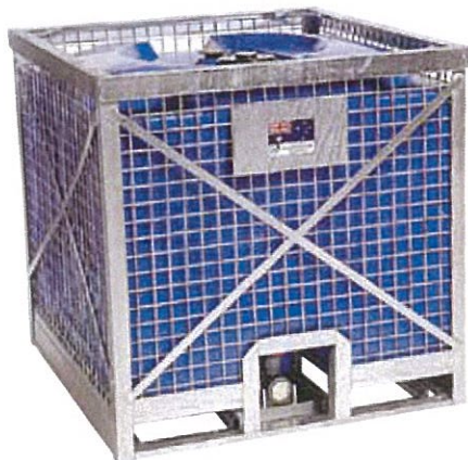
E1123 1000 litre Bulkibox™