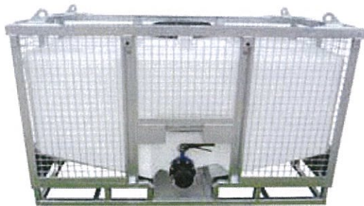
E1770A 1800 litre Bulkibox™