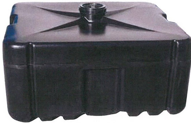
E0376 400 litre Fire Fighter Utility Tank