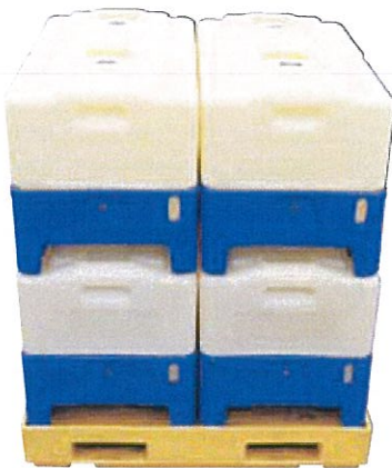
E1422 100 litre Microbox™