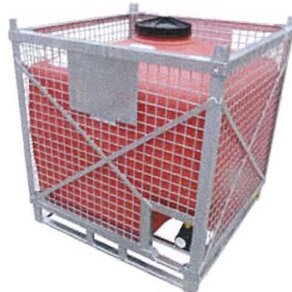
E0775 1000 litre Light Duty Bulkibox™