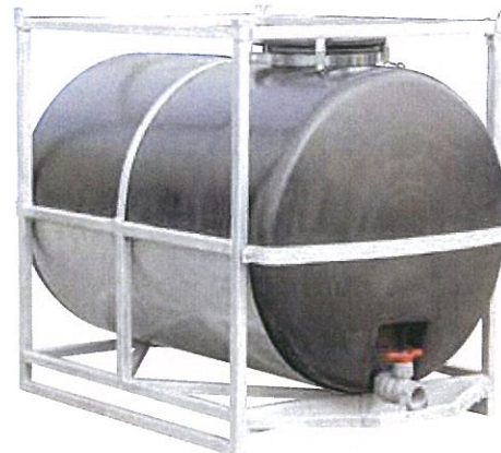
E0075 1000 litre Liquid Transporting Tank