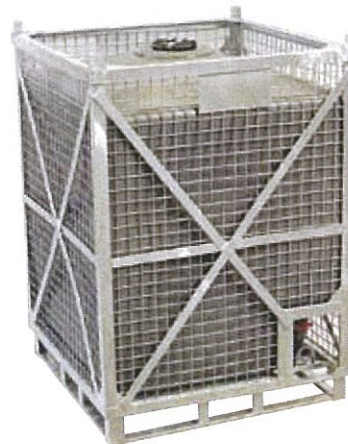
E0469 1500 litre Bulkibox™