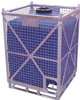
E0903 1500 litre Bulkibox™