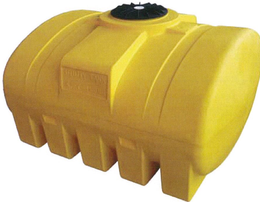
E0538 1000 litre Fire Fighter Utility Tank