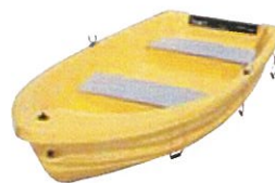
E0485 Pioneer 12