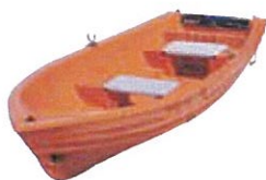
E0484 Pioneer 10