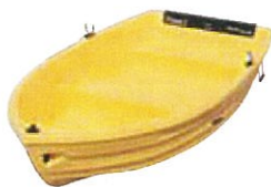
E0483 Pioneer 8