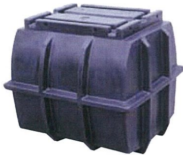
E0481 Small Marina Float