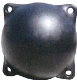
E1417 Mussel Float

Together with the leading mussel farmers in the country, Superior Pak has developed a state of the art Mussel Float. Complete with 4 reinforced rope connection points, the Superior Pak Mussel Float comes with a 50 mm re-sealable bung for ease of access when ballasting. Tough and durable UV stabilized polyethylene has been used in the manufacture of this product.