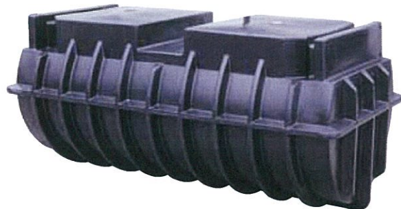
E0535 Large Marina Float