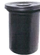
E0017 45 litre Drum E0024 45 litre Drum Lid