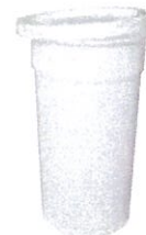
E0007 90 litre Tall Drum E0008 90 litre Tall Drum Lid