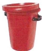
E0003 45 litre Drum E0004 45 litre Drum Lid