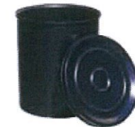
E0546A 60 litre Drum/Lid