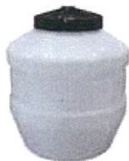
E0984 120 litre Barrel