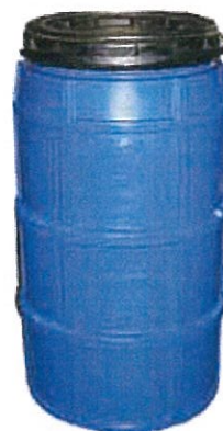
E1625 200 litre Barrel