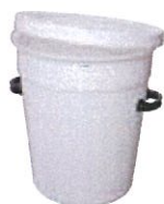
E0009 90 litre Drum