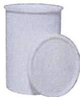
E0814A 160 litre Drum/Lid