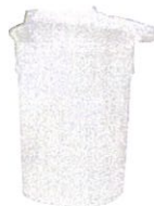
E0206 65 litre Drum E0206L 65 litre Drum Lid