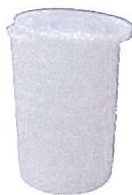
E0012 200 litre Drum E0013 200 litre Drum Lid