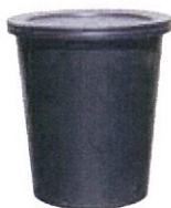
E0022A 270 litre Drum/Lid