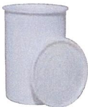
E0014 225 litre Drum E0013 225 litre Drum Lid