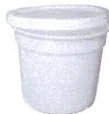
E0005 70 litre Drum E0006 70/90 litre Drum Lid