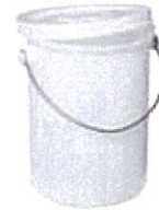
E0001 25 litre Drum E0002 25 litre Drum Lid