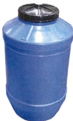
E0459 200 litre Barrel