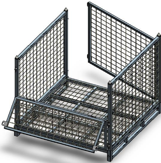
(Front Top Frame & Rear Frame shown in Open position)

This multi-use pallet size cage is designed to suit all warehousing and storage requirements with the advantage of being quickly dismantled for valuable space saving and transport efficiency. This durable, economical cage can be transported by Forklift or Pallet Trolley and can be stacked up to 4 high when empty and 2 high when loaded. Front drop down gate and rear hinge gate are both removable and are able to be opened for easy access, even when stacked. Optional galvanised sheet metal flooring which fits over the existing mesh Base Frame, is available upon request.