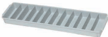
M-VCT001 Small 600 Series Tray *Dividers sold separately

MAT: Polypropylene EXT: 600 x 148 x 50mm INT: 590 x 130 x 45mm WT: 0.4kg CAP: - COL: Grey ACC: M-VCD001 Divider PK: 30 PLT: 360