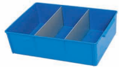
M-VSTD4003BL Large 400 Series Tray *2 dividers included

MAT: Polypropylene EXT: 400 x 146 x 100mm INT: 370 x 130 x 97mm WT: 0.4kg CAP: - COL: Blue ACC: M-VSD002 Divider (x2) PK: 8 PLT: 256