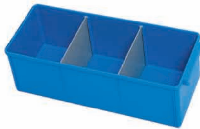
M-VSTD4002BL Medium 400 Series Tray *2 dividers included

MAT: Polypropylene EXT: 400 x 146 x 50mm INT: 370 x 130 x 45mm WT: 0.2kg CAP: - COL: Blue ACC: M-VCD001 Divider (x4) PK: 18 PLT: 576