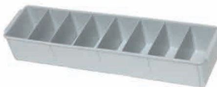
M-VCT002 Medium 600 Series Tray *Dividers sold separately

MAT: Polypropylene EXT: 600 x 148 x 50mm INT: 590 x 130 x 45mm WT: 0.4kg CAP: - COL: Grey ACC: M-VCD001 Divider PK: 30 PLT: 360