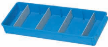
M-VSTD4001BL Small 400 Series Tray * 4 dividers included

MAT: Polypropylene EXT: 400 x 146 x 50mm INT: 370 x 130 x 45mm WT: 0.2kg CAP: - COL: Blue ACC: M-VCD001 Divider (x4) PK: 18 PLT: 576