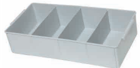
M-VCT003 Large 600 Series Tray *Dividers sold separately

MAT: Polypropylene EXT: 600 x 148 x 100mm INT: 590 x 130 x 95mm WT: 0.6kg CAP: - COL: Grey ACC: M-VSD002 Divider PK: 15 PLT: 180