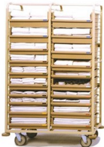
TOTE CARRIER FOR RESERVE LINEN