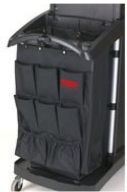
Optional 9T90 Fabric 9-Pocket Organiser