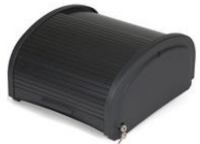
Locking security hood