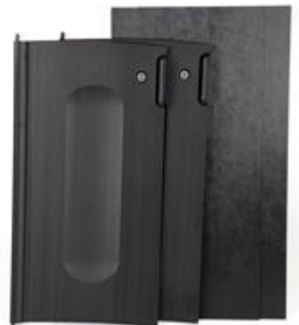
Locking cabinet door kit