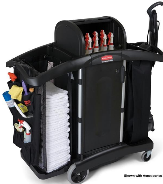
Shown with Accessories

Rubbermaid 9T78 High Security Housekeeping Cart Length: 131.4 cm Height: 135.9 cm Width: 55.9 cm